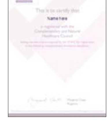
CNHC leaflet CNHC Appointment Card