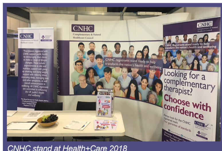
CNHC stand at Health+Care 2018

Overall, we felt the event was very successful and we were pleasantly surprised with how willing and interested the attendees were in learning more about CNHC and what we do.